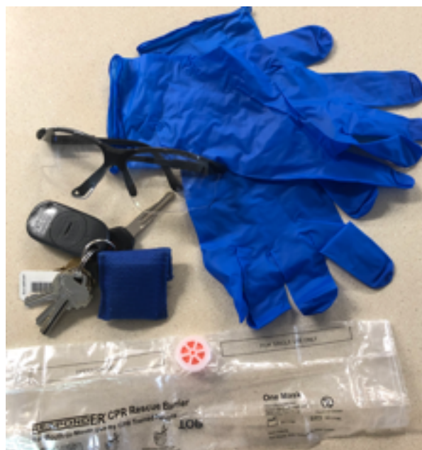
(Known as “Universal Precautions”)