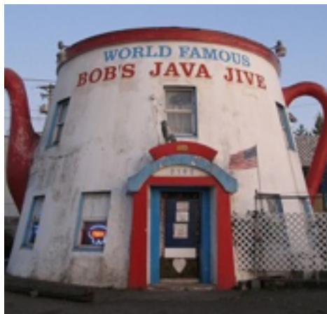
(This is an example of a landmark which is just a name of building.)