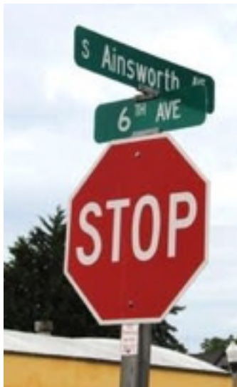
(This is an example of cross streets.)

Every TFD fire engine and ladder company is staffed with 3 EMT's, Squad units provide 2 EMT's who provide basic life support. Some companies are also staffed with a paramedic.